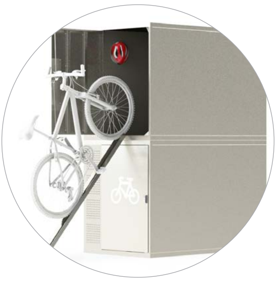
Optional (TBL ramp) wheel ramp Securabike's unique gas strut power assist system.

Material Specifications (General) Material I.6mm Galvabond® sheet